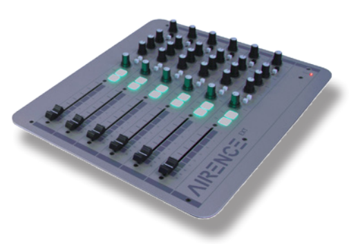
6 channel Extender

The AIRENCE main unit has 4 balanced, phantom powered mic inputs with inserts for voice processors. Six stereo line inputs, 4x USB channels and 2x Telephone Hybrids. Only one physical USB connection is the interface to transfer 4 stereo audio channels from and to your PC. Channel 5 and 6 have, apart from the stereo line input, also RJ-11 connectors to interface with an analog telephone line and a desk phone with dial unit. High quality built in Hybrids with direct access R and C balance and Talk back to the Hybrid channels make conversation with callers very easy. The Cue bus is also a communication buss, so the announcer can easily have a discussion with the caller outside the broadcast. Just hit the two related CUE buttons and you're talking. There is a very musical 3 band Equalizer on channel 1-4 and on all 6 Triple input channels of the Extender Unit. The stereo Aux send can be selected pre or post fader. And all high quality low noise mic inputs have low cut jumpers.